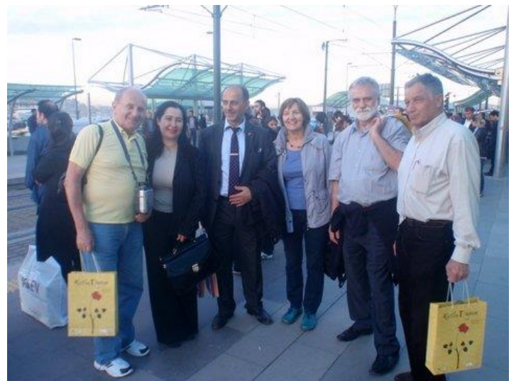
Farewell - thank you Turkey !