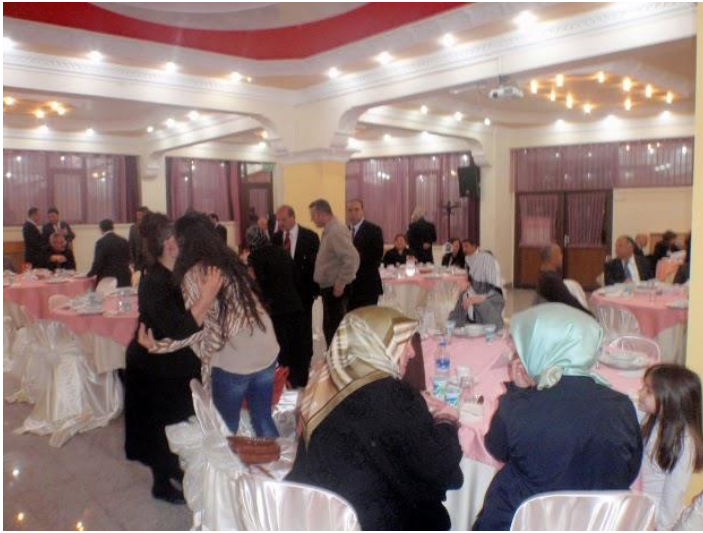
The welcome event in Ankara