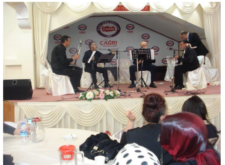
Spanish quartet concert