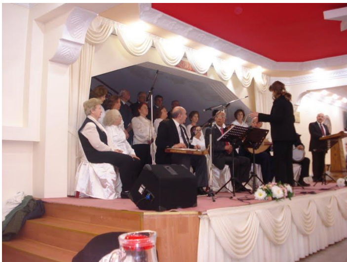
Performance of Turkish singers and musicians