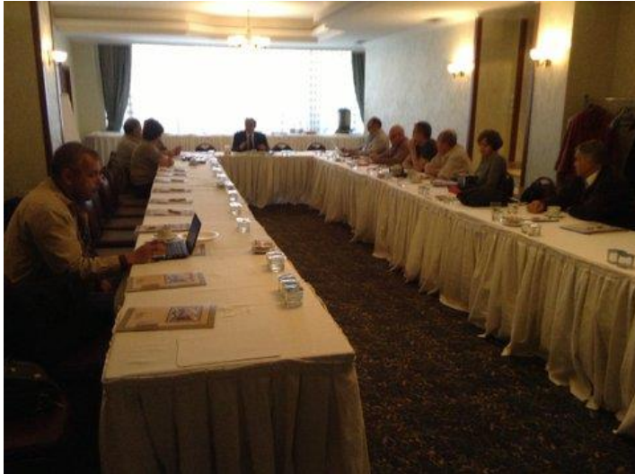
Partners' meeting in Ankara