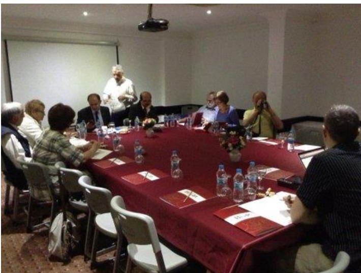
Working day in Istanbul