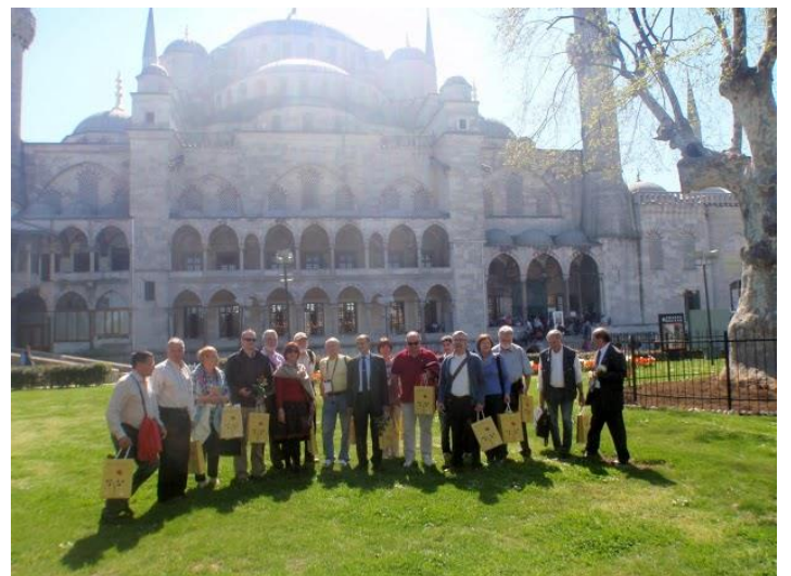
In front of the Blue Mosque