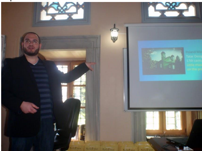
The lecture about Islam