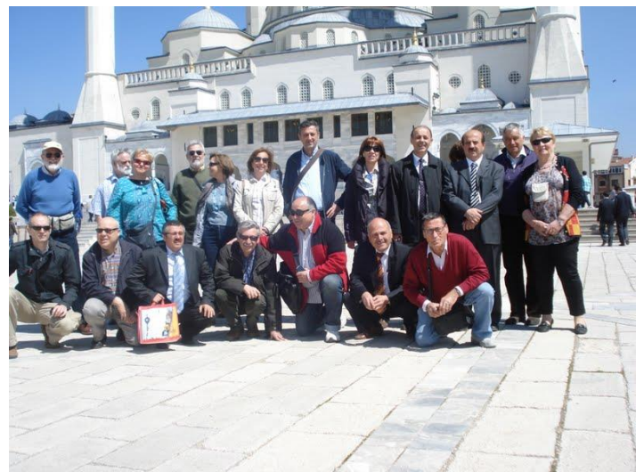
In front of the Mosque