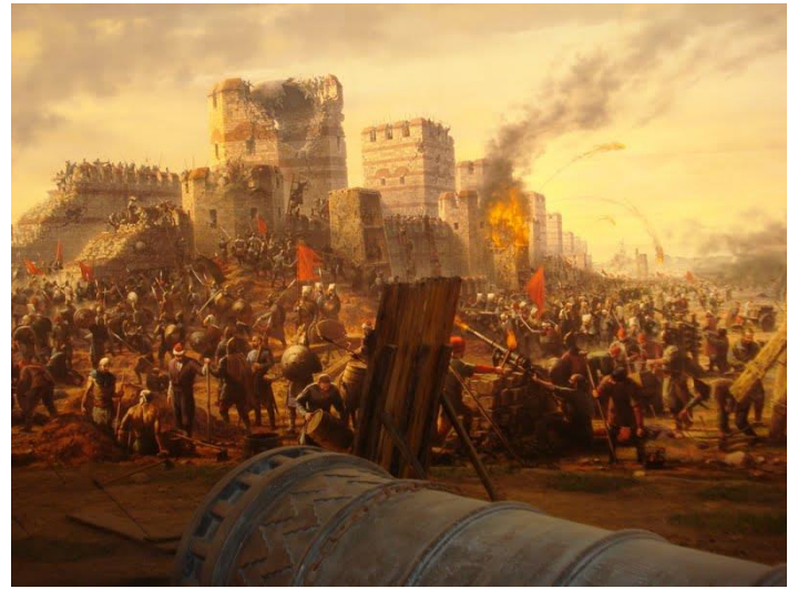
The Historical Museum - Panorama 1453