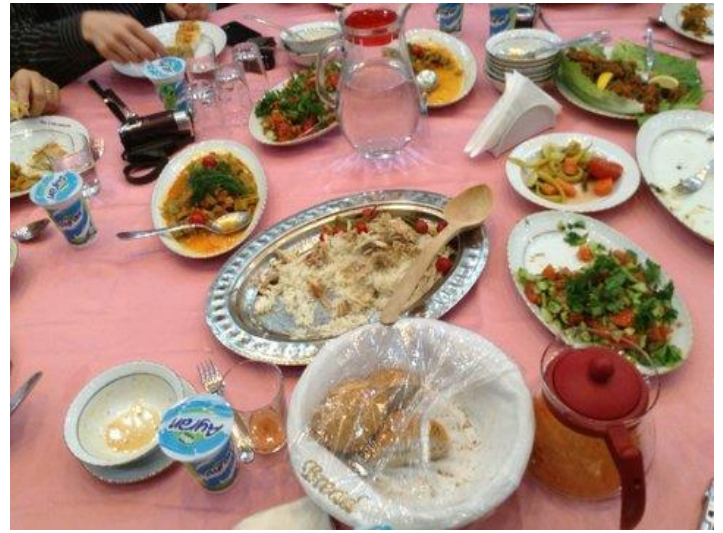
Taste of the Turkish food