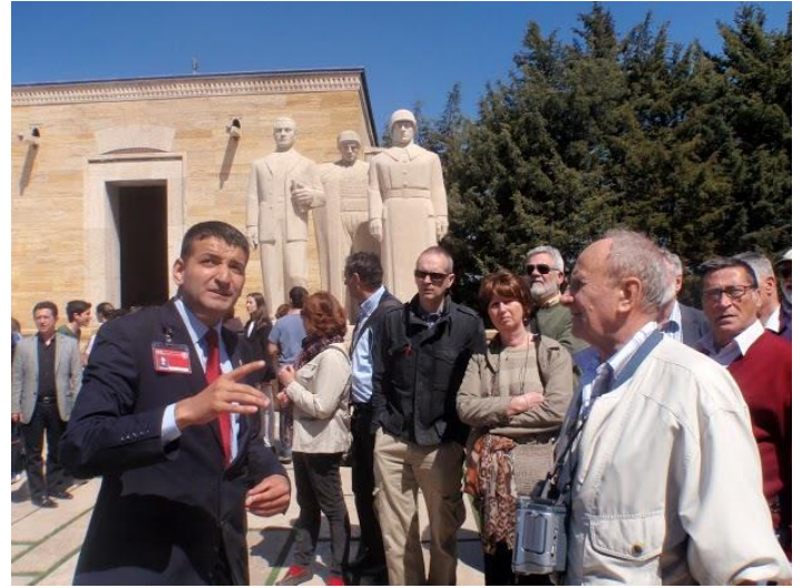
The guided tour in Ankara