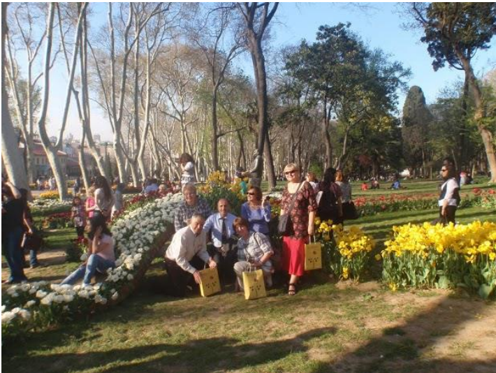
Festival of tulips in Istanbul