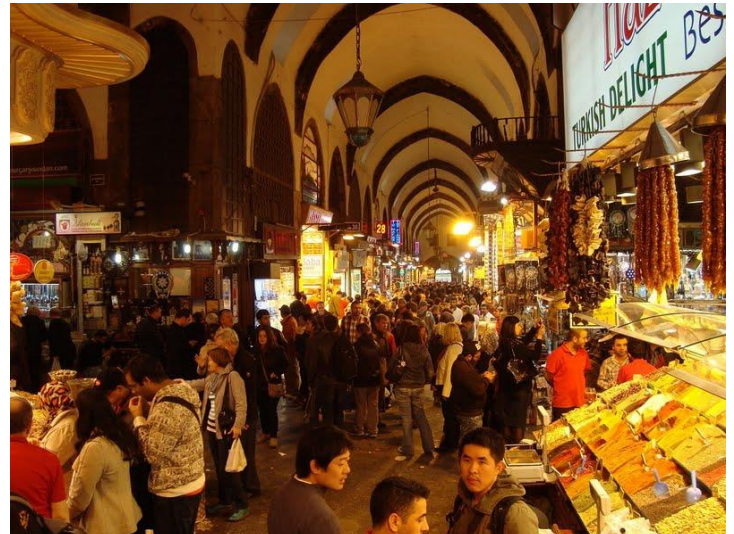
Egyptian bazaar full of Turkish spices