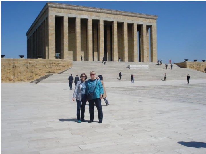
Mauzoleum of Ataturk, the first President of Turkey Republic