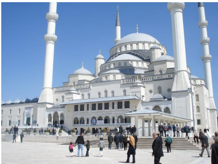
The newest and the largest Mosque in Ankara