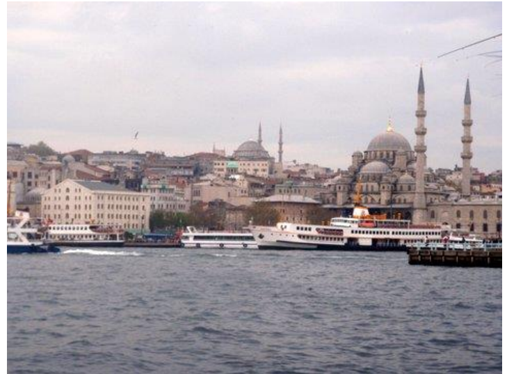
Istanbul – transcontinental city