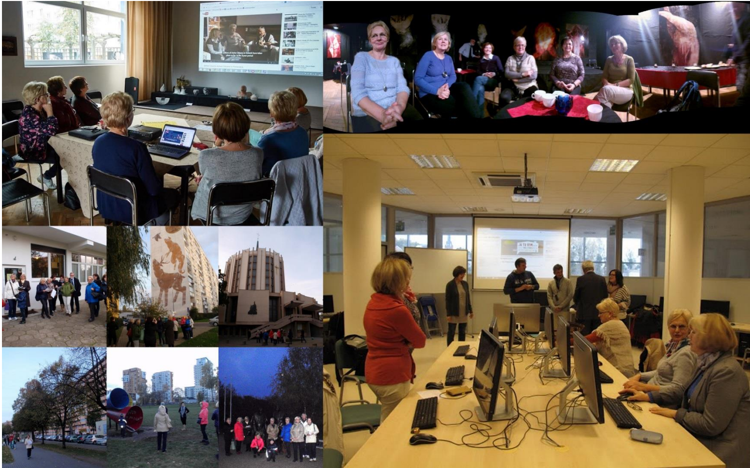
ForAge Business Meeting and Third pan-European Conference, Lisbon and Porto 5th – 8th November 2014